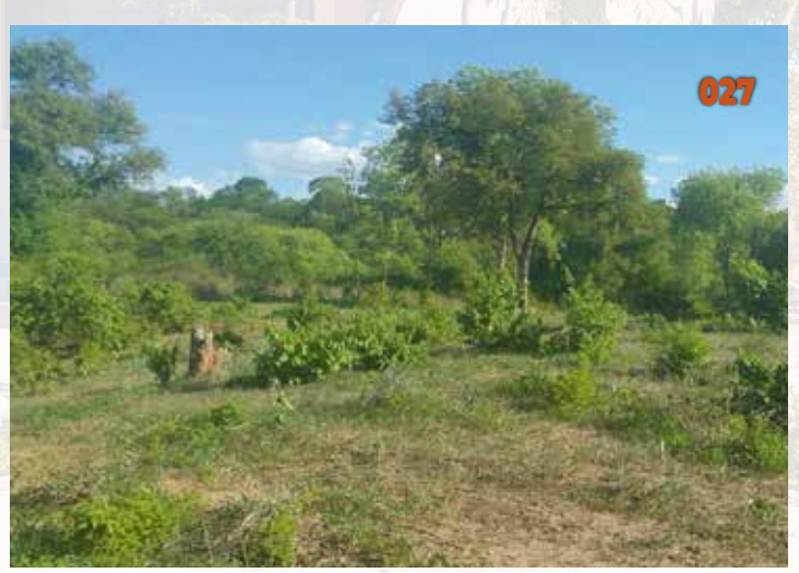
FOR SALE: CHONGWE