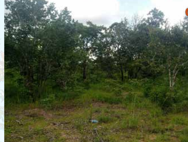
FOR SALE: MUNGULE