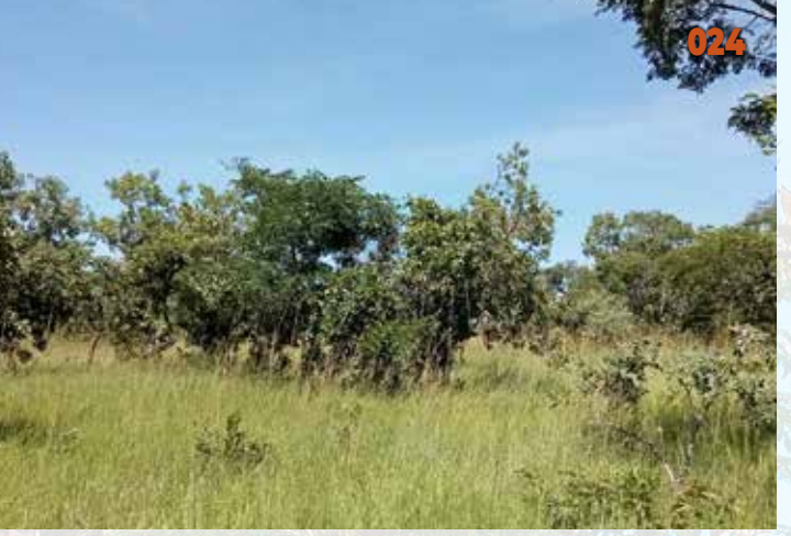
FOR SALE: MPIKA