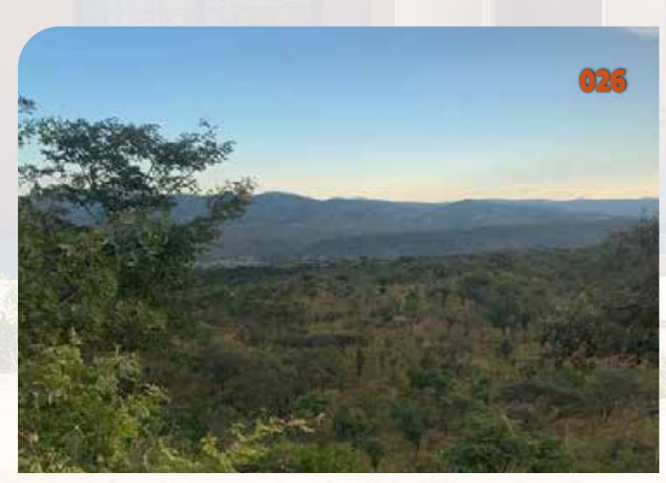
FOR SALE: KAFUE GORGE