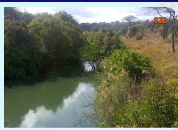
FOR SALE: LUFWANYAMA