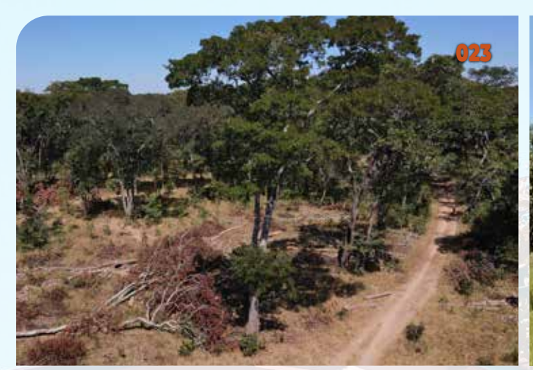
FOR SALE: CHONGWE