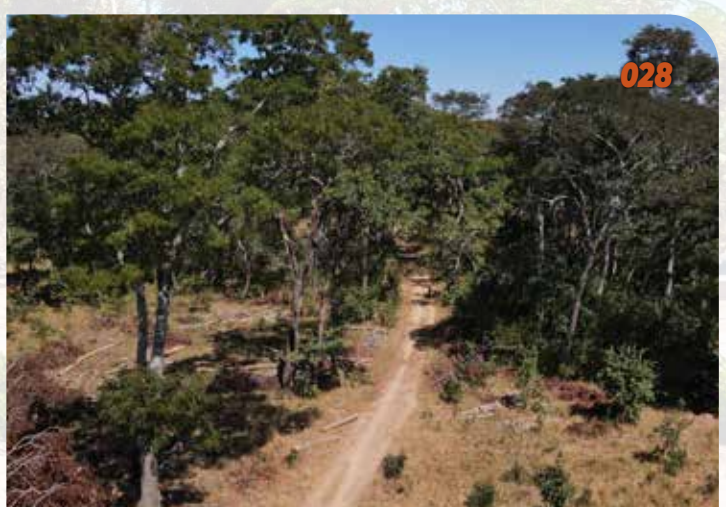
FOR SALE: CHIAWA